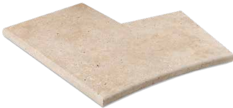
Bullnose Outside Corner