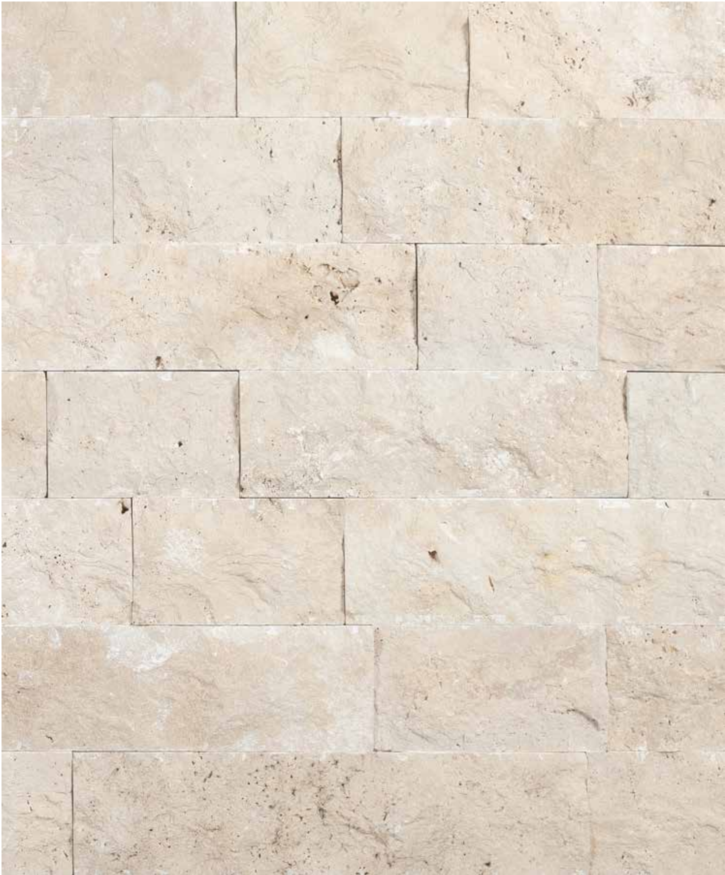
LIGHT Split Face