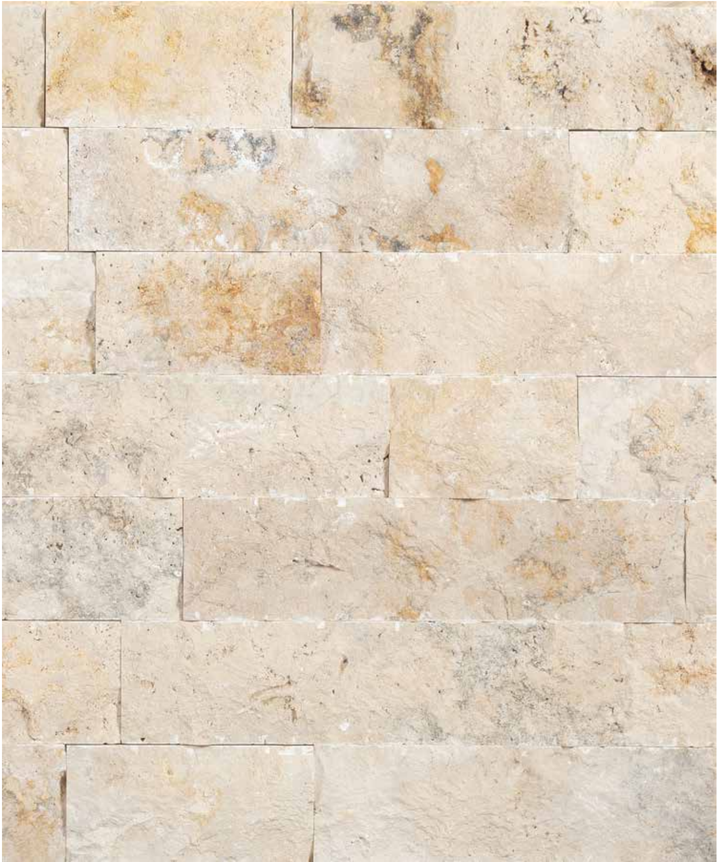
COUNTRY CLASSIC Split Face