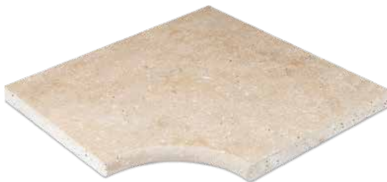
Bullnose Inside Corner